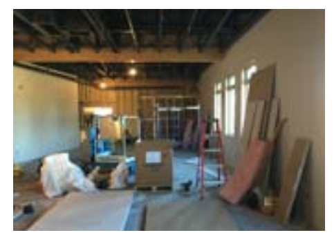
Drywall nearly complete in offices & youth room.