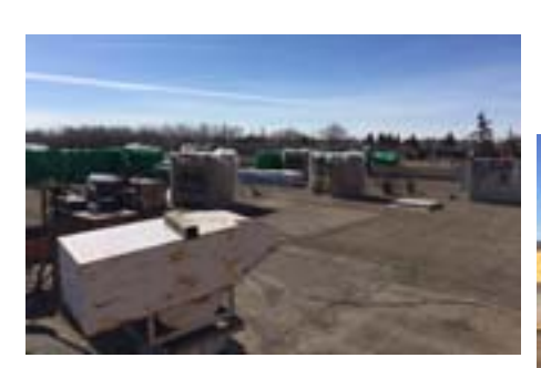
Replacement of roof on south portion of existing building is well underway!